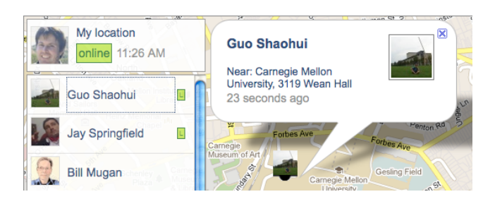
Figure 1: A screenshot of Locaccino.

underlying sharing policy. In order for machine learning to be useful for learning security and privacy policies, the user must always be in control of the underlying policy. This means that the policy suggestions made by the algorithm must be intelligible by the user, and the user must be able to approve or refute any changes the algorithm makes. Additionally, as the user's preferences evolve, she may want to manually change the underlying policy. The algorithm should therefore be able to adapt to this, incorporating new manual policy changes into the underlying model. This suggests an incremental approach to policy learning.